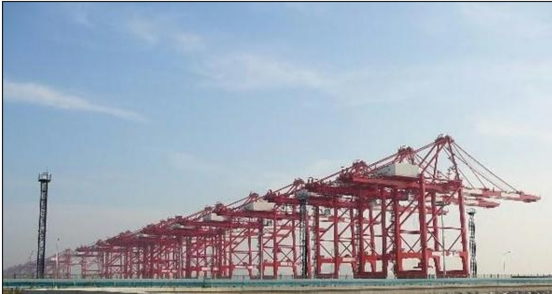
Figure 1.1: Yangshan Container Terminal subjected to Simulation Models

The Peter Kiewit Institute provide the possibility to extensively demonstrate and test models and solution for applications of simulators; and even if the Experience in Omaha R&D Center was shorter than expected, it was possible to complete the demonstration of the interoperable simulators devoted to cooperative training in industrial facilities [Bruzzone 1998]; in addition the experimentation on CUMANA Project was completed with a team of engineers in order to compare the result obtained in Seattle with Boeing. The analysis of the data was based on DOE and statistical analysis [Bruzzone, Mosca 2003; Kliem et al.1997].